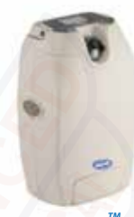
Invacare Solo2™ Weight: 19.9 lbs Dims: 16.5" x 11" x 8"