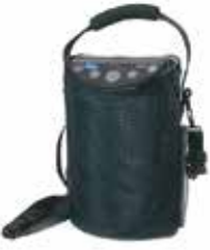
Invacare XPO2M™ Weight: 6 lbs Dims: 10" x 7" x 4"

CONSULT YOUR DOCTOR ABOUT FLYING WITH OXYGEN. NEED MORE CARDS LIKE THESE? EMAIL INFO@AEROMEDIC.COM