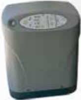
DeVilbiss Healthcare iGo™ Weight: 19 lbs Dims: 15" x 11" x 8"