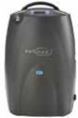
SeQual Eclipse® Weight: 17.9 lbs Dims: 19.3" x 12.3" x 7.1"