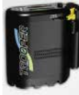
VBOX Trooper™ Weight: 4.3 lbs Dims: 6" x 2.8" x 7.25"