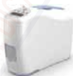
Inogen G2™ Weight: 7 lbs Dims: 11.61" x 5.98" x 10.75"