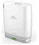
Philips Respironics™ SimplyGo Mini Weight: 5 lbs. Dims: 10.2" x 8.3" x 2.6"