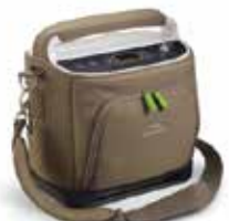
Philips Respironics SimplyGo™ Weight: 10 lbs Dims: 11.5" x 10" x 6"