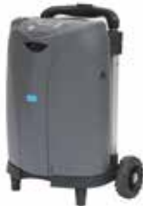
SeQual Equinox (US)™ & Oxywell (Japan)™ Weight: 14 lbs Dims: 13.6" x 10.6" x 7.4"