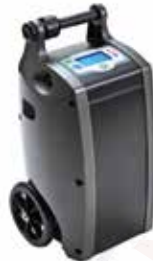
OxLife Independence™ Weight: 16.7 lbs Dims: 20.29" x 10.85" x 9.45"