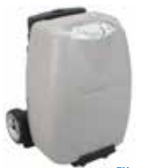
Precision Medical™ EasyPulse TOC Weight: 11.5 lbs Dims: 14.63" x 10.5" x 7"