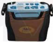
Inova Labs ActivOx™ Weight: 4.83 lbs Dims: 9.05" x 7.875" x 4.38"