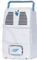
AirSep FreeStyle 5™ Weight: 6.2 lbs Dims: 10.7" x 6.6" x 4.4"