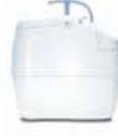
Inogen One™ Weight: 9.7 lbs Dims: 11.62" x 6" x 12.39"