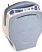
Inova Labs LifeChoice™ Weight: 4.9 lbs Dims: 9.5" x 7.5" x 3.125"