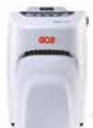
GCE Healthcare Zen-O™ Weight: 10.3 lbs. Dims: 8.3" x 6.6" x 12.3"