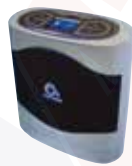
O2 Concepts™ Oxlife Freedom Weight: 5.5 lbs Dims: Unavailable at Press Time