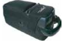
Precision Medical EasyPulse™ Weight: 6.8 lbs Dims: 10.1" x 6.5" x 4.5"