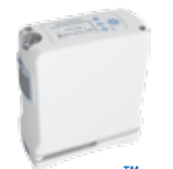
Inogen G4™ Weight: 2.8 lbs. Dims: 7.2" x 5.91" x 2.68"