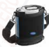
Invacare™ Platinum Mobile Weight: 4.98 lbs Dims: 9.45" x 7.5" x 3.88"