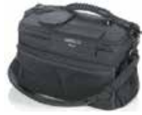
Philips Respironics EverGo™ Weight: 8.5 lbs Dims: 12" x 6" x 8.5"