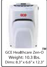
GCE Healthcare Zen-O™ Weight: 10.3 lbs. Dims: 8.3" x 6.6" x 12.3"