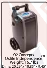
O2 Concepts Oxlife Independence™ Weight: 16.7 lbs Dims: 20.29" x 10.85" x 9.45"