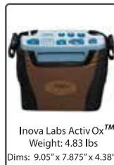
Inova Labs ActivOx™ Weight: 4.83 lbs Dims: 9.05" x 7.875" x 4.38"