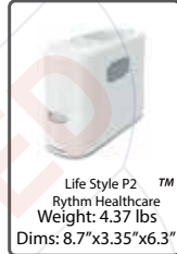
Life Style P2™ Rythm Healthcare Weight: 4.37 lbs Dims: 8.7" x 3.35" x 6.3"