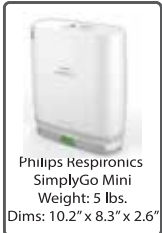
Philips Respironics™ SimplyGo Mini Weight: 5 lbs. Dims: 10.2" x 8.3" x 2.6"