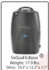
SeQual Eclipse® Weight: 17.9 lbs Dims: 19.3" x 12.3" x 7.1"