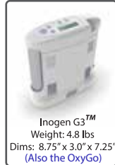
Inogen G3™ Weight: 4.8 lbs Dims: 8.75" x 3.0" x 7.25" (Also the OxyGo)