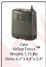
Caire AirSep Focus™ Weight: 1.75 lbs Dims: 6.2" x 4.6" x 2.4"