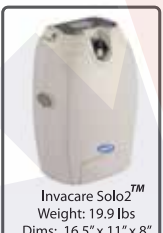
Invacare Solo2™ Weight: 19.9 lbs Dims: 16.5" x 11" x 8"