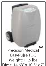
Precision Medical™ EasyPulse TOC Weight: 11.5 lbs Dims: 14.63" x 10.5" x 7"