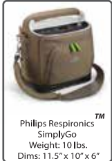
Philips Respironics™ SimplyGo Weight: 10 lbs. Dims: 11.5" x 10" x 6"