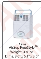
Caire AirSep FreeStyle™ Weight: 4.4 lbs Dims: 8.6" x 6.1" x 3.6"