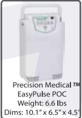
Precision Medical™ EasyPulse POC Weight: 6.6 lbs Dims: 10.1" x 6.5" x 4.5"