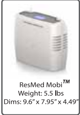
ResMed Mobi™ Weight: 5.5 lbs Dims: 9.6" x 7.95" x 4.49"