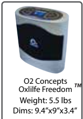
O2 Concepts™ Oxlife Freedom Weight: 5.5 lbs Dims: 9.4" x 9" x 3.4"