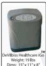
DeVilbiss Healthcare iGo™ Weight: 19 lbs Dims: 15" x 11" x 8"