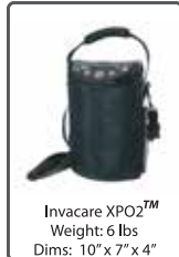
Invacare XPO2™ Weight: 6 lbs Dims: 10" x 7" x 4"