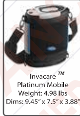
Invacare™ Platinum Mobile Weight: 4.98 lbs Dims: 9.45" x 7.5" x 3.88"