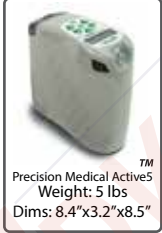
Precision Medical™ Active5 Weight: 5 lbs Dims: 8.4" x 3.2" x 8.5"