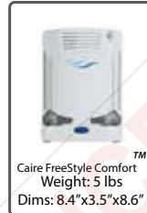
Caire FreeStyle Comfort™ Weight: 5 lbs Dims: 8.4" x 3.5" x 8.6"