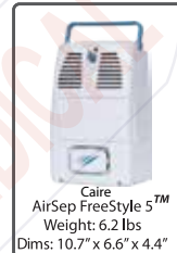
Caire AirSep FreeStyle 5™ Weight: 6.2 lbs Dims: 10.7" x 6.6" x 4.4"