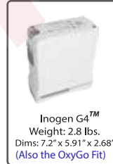
Inogen G4™ Weight: 2.8 lbs. Dims: 7.2" x 5.91" x 2.68" (Also the OxyGo Fit)