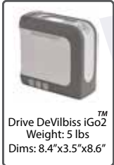
Drive DeVilbiss iGo2™ Weight: 5 lbs Dims: 8.4" x 3.5" x 8.6"