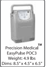
Precision Medical™ EasyPulse POC3 Weight: 4.9 lbs Dims: 8.5" x 4.5" x 6.5"