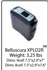
Belluscura XPLO2R™ Weight: 3.25 lbs Dims: 4cell 7.3" x 2.9" x 7" Dims: 8cell 7.3" x 2.9" x 7.6"